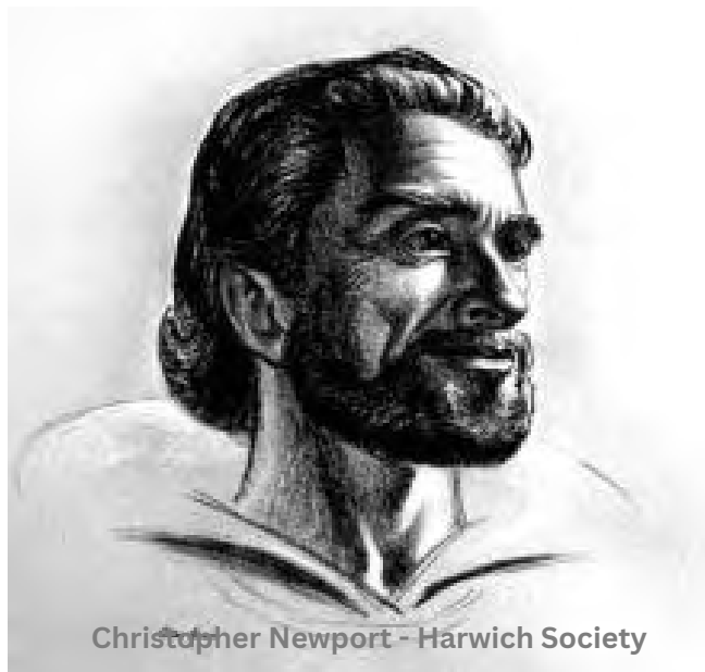
Christopher Newport - Harwich Society

Baptized December 29, 1561 in Harwich, Newport was captain of the Susan Constant, the largest of three ships which carried settlers for the Virginia Company in 1607 on the way to found the settlement at Jamestown in the Virginia Colony, which became the first permanent English settlement in North America.