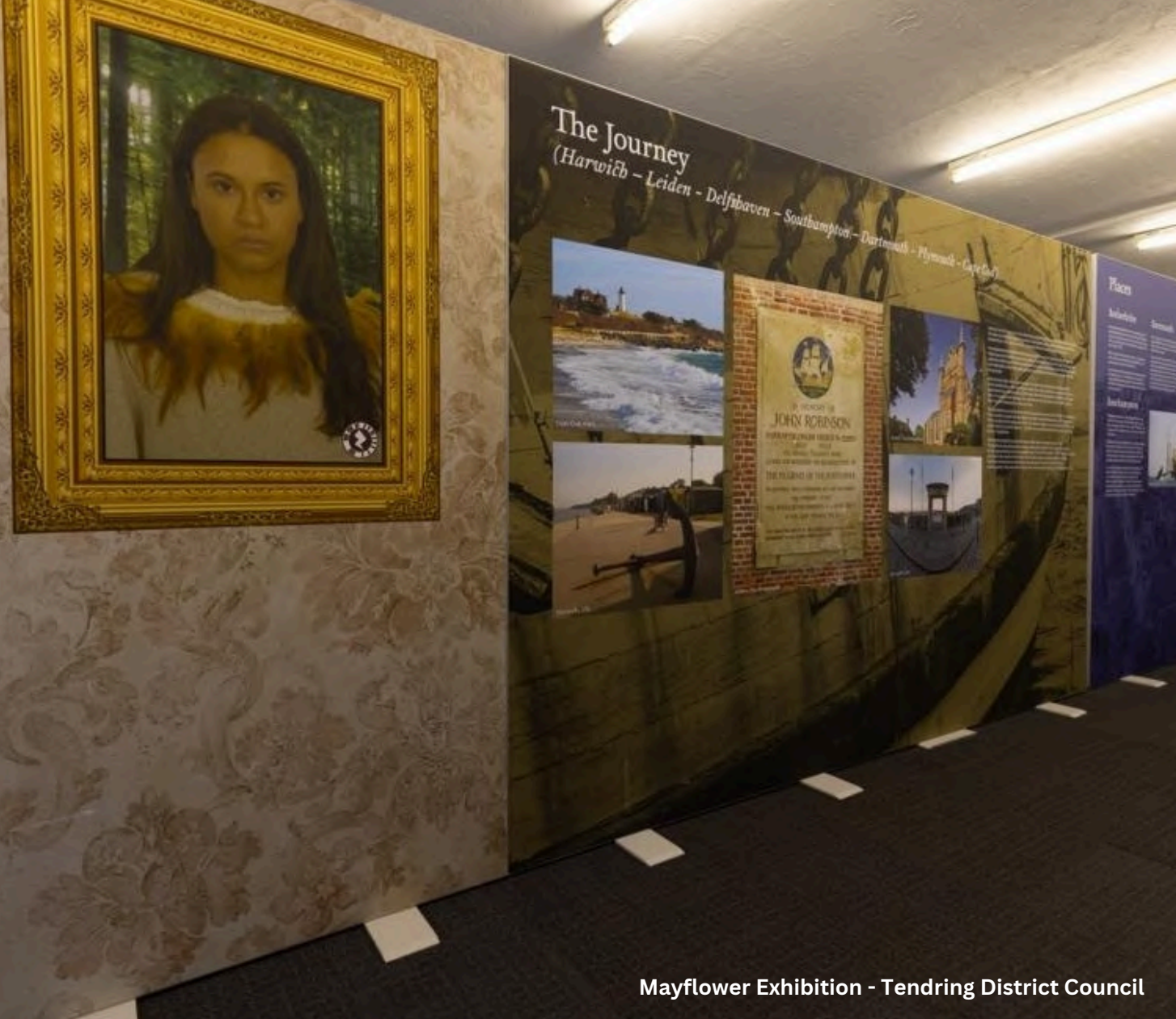
Mayflower Exhibition - Tendring District Council