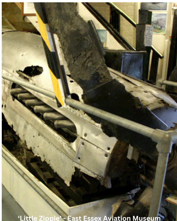
'Little Zippie' - East Essex Aviation Museum

The aircraft was being flown by United States Flying Officer Raymond King of the 436th FS, 479th FG, on an escort mission on 13 January 1945 where it experienced engine troubles before it ditched half a mile off the Clacton coastline.