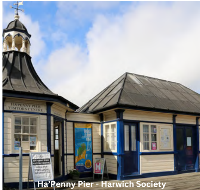
Ha’Penny Pier - Harwich Society

Inside Ha’Penny Pier, Harwich is an exhibition on Harwich and the New World, featuring Christopher Newport and Jamestown 1607 and Christopher Jones and the Mayflower 1620.