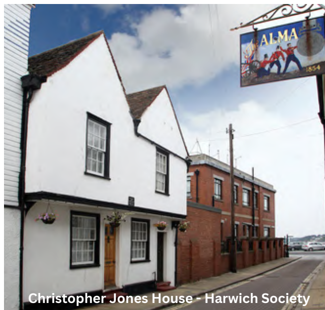
Christopher Jones House - Harwich Society

Visitors are able to see many of the original features and can bring their experience to life using the augmented reality. Display boards tell the story