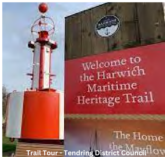
Trail Tour - Tendring District Council

In commemoration of the 400th anniversary of the voyage of the Mayflower, a self guided trail tour was designed to tell the story of the town, its maritime history and its strong links to the Mayflower.