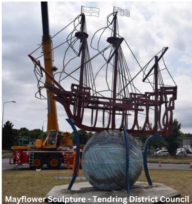
Mayflower Sculpture - Tendring District Council

The globe reflects the interpretation of iron bearing waters, and the international legacy of the Mayflower.