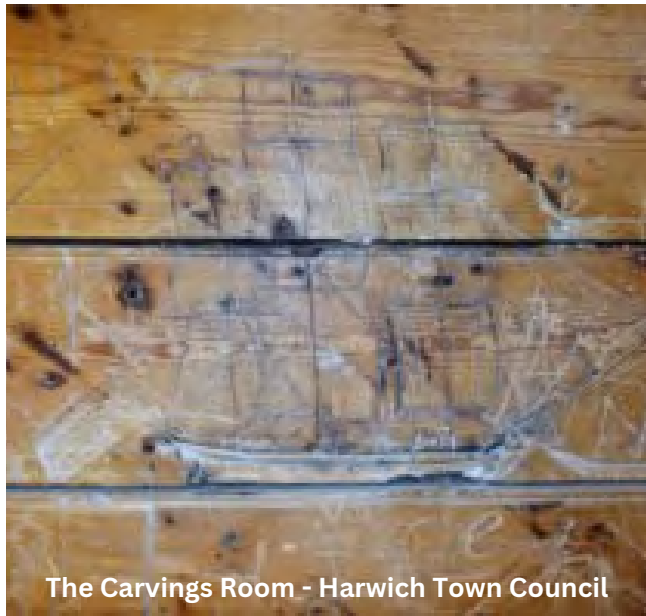
The Carvings Room - Harwich Town Council

A unique carving etched into the wooden walls of one of the rooms of the Guildhall, Harwich is a carving of a ship flying the Stars and Stripes dating from the time of the American War of Independence.