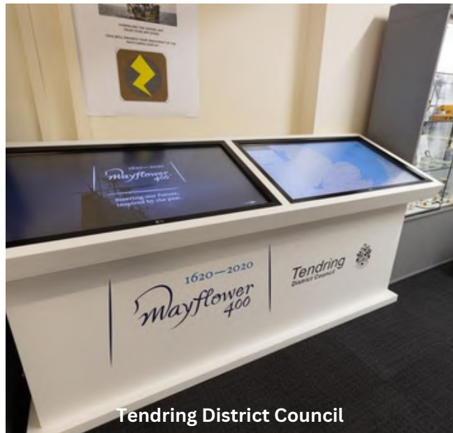
Tendring District Council

This exhibition is currently being relocated.