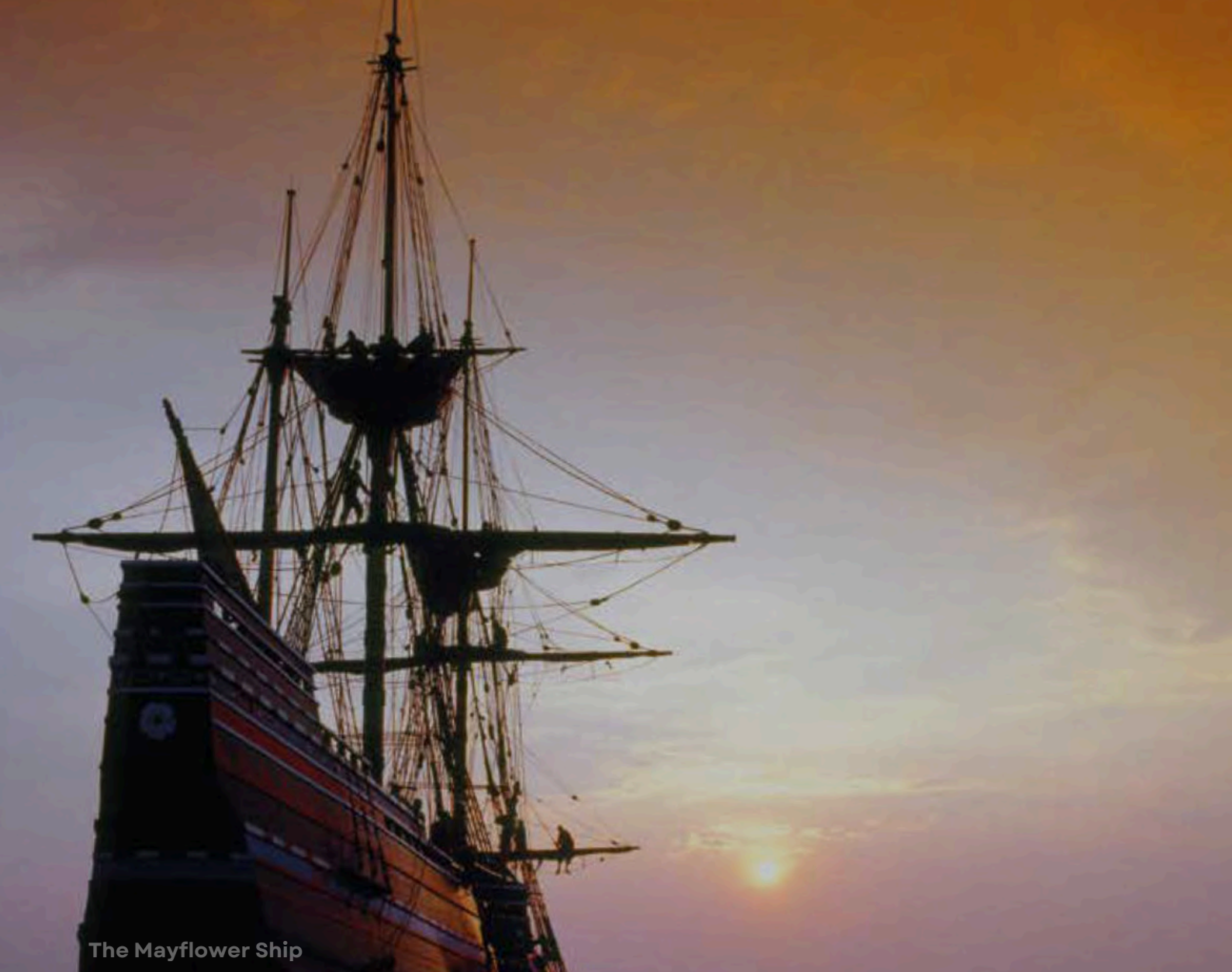
The Mayflower Ship